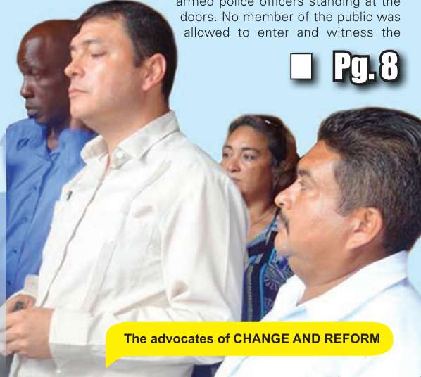
The advocates of CHANGE AND REFORM